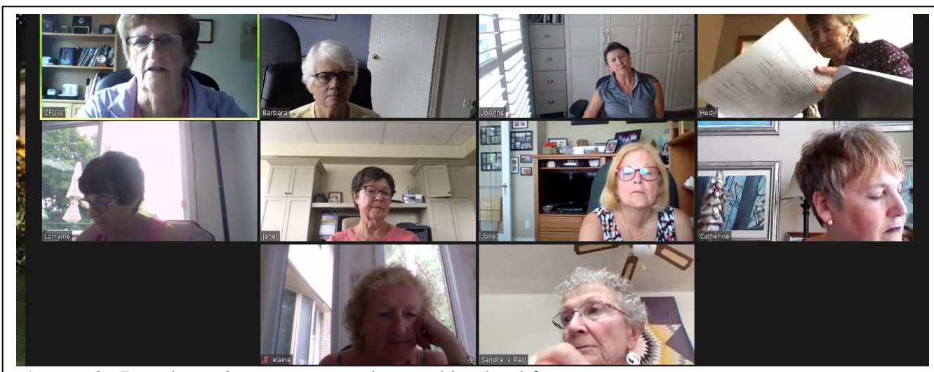
August 26 Board meeting: your executive working hard for you.