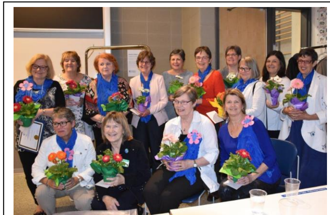
CFUW Oshawa & District joined forces with CFUW Ajax-Pickering to host the 2018 Ontario Council AGM in May. This is the committee that made it happen.

Oshawa CFUW Facebook: https://www.facebook.com/CfuwOshawaAndDistrict