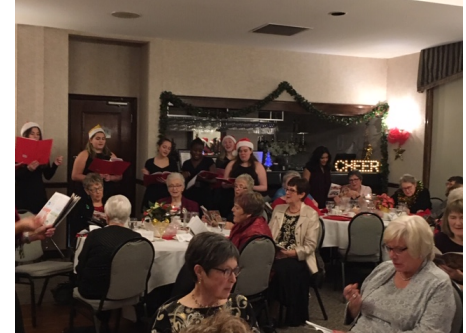
The O'Neill choir once again sang for us and with us.