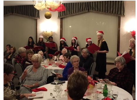
Holiday dinner, December 5, 2018 at Harmony Golf Centre

For what we received today let us be truly thankful: for waking up this morning, a roof over our heads, water in our taps, the love and kindness of our family and friends and for the gift of time. For what we are about to receive, let us be truly thankful: for the meal we are about to eat, the camaraderie we are about to share, the love and kindness of our family and friends and for the gift of time.