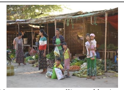
Myanmar women selling and buying produce with their children.

World travel gives us an opportunity to see how others, especially women, live in other lands. I have just returned from a two-week tour along the Irrawaddy River of Myanmar from Mandalay (in the centre of the country) to Yangon on the coast of the Andaman Sea. Democracy was re-established just 8 years ago after a long military dictatorship. Living standards vary considerably with most rural villages generally operating without electricity and sanitation. City living ranges economically from crowded downtown apartment buildings to