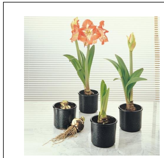
"In the bulb there is a flower..." N. Sleeth