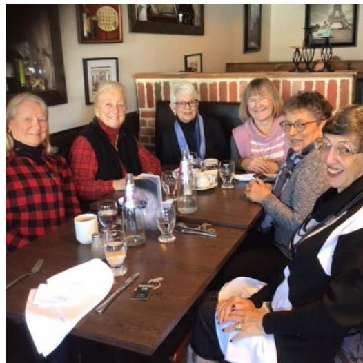
Club members and guests enjoying lunch at Bistro 238 in Courtice on February 24, 2023.