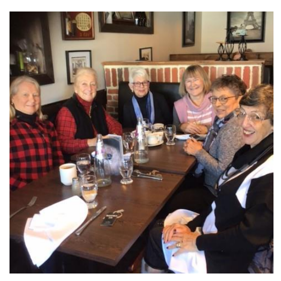
Club members and guests enjoying lunch at Bistro 238 in Courtice on February 24, 2023.