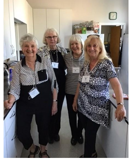
Ladies of the Social Committee