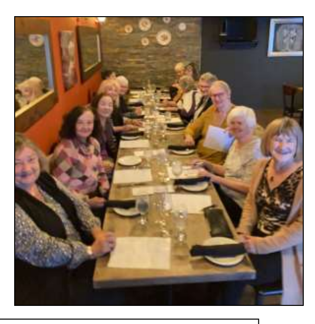
October's Ladies Who Lunch at A Tavola in Whitby